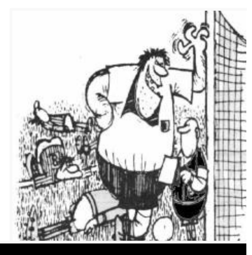
What're you doing ref... making your will?